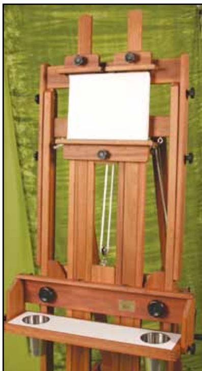
Richeson Lyptus® Wood Santa Fe II easel shown with middle painting tray

Not only are Lyptus® plantations using land that had become useless by years of intensive logging and farming, but for every two hectares (1 Hectare = 2.471 Acres) of Lyptus® plantation planted, one hectare of new native forest is planted. The mills used to produce Lyptus® Wood use proprietary technology in a sustainable and an environmentally friendly manner. The entire process from planting, to pruning, to manufacturing is carried out with the environment in mind.